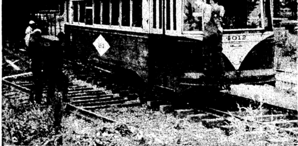
Old No. 4012, former Broadway and Bellrose car, rolls off main line onto siding to await display in transportation museum planned at Pioneer Park adjoining Oaks Amusement Park. Plans are to put about 40 old locomotives and trains in transportation museum.